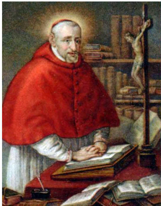
St. Robert Bellarmine Patron of Catechists & Catechumens Pray for us